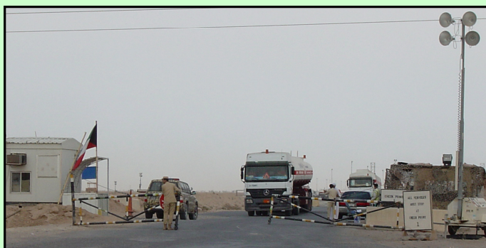
The Kuwait/Iraq Military Border Post – from the Kuwait side! ... mortars going off 1 km away.

My October/November world trip to Canada, the UK and Iraq ... ( Iraq very briefly I hasten to add) was most promising. 'Base Stats' reporting will soon come to Winnipeg, Manitoba and other prairie provinces, (in association with the Frontier Centre for Public Policy ) along with Nova Scotia, (the Atlantic Institute for Market Studies 'AIMs' of Halifax). I am assisting local government folk in these regions with the development of a performance measurement framework derived from the tried and tested 'Base Stats' formula. Watch this space.